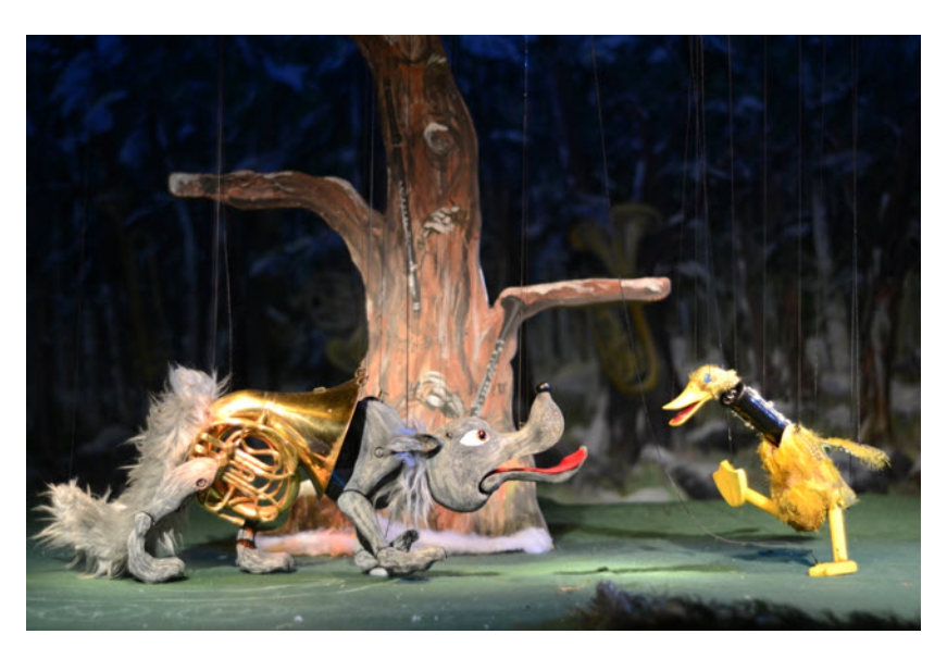
'The Duck gets so excited, she jumps right out of the pond' as the hungry Wolf eyes up his next meal!

But our Duck has an oboe for a neck and our Wolf a French horn for guts! This show carries to the ultimate, Prokofiev's original idea of using musical instruments to represent his Russian characters and offers a unique theatrical blend of his glorious music with magical settings. The backcloth drips with musical instruments hanging from trees! You are in for a unique experience in one of the few residential marionette theatres in the country.